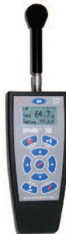
Spark® 706RC w/MPR002 Mast Microphone

These advanced new capabilities join together with a modest price to make the Spark® Series a superior value for practitioners of occupational noise monitoring programs.